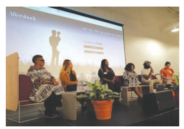
Members of the panel leading a community discussion on maternal and infant health disparities in the Black community.

Heathy Start, a program of Johns Hopkins All Children's Hospital (JHACH), works to reduce disparities in maternal and infant health in high-risk communities. Focusing on communities with infant mortality rates at least 1.5 times the national average, Healthy Start supports women before, during, and after pregnancy by addressing their health and social service needs, strengthening father and family resilience and engaging community partners to enhance systems of care. The program works to ensure individuals receive cultural humility through family-centered and comprehensive health, and social services for women, men, infants and their families. Healthy Start programs provide a forum for a community voice and they participate in Community Action Networks (CANs) that mobilize health care, social service, and other providers to coordinate services, and steer local action to address social determinants of health related to poor birth outcomes.