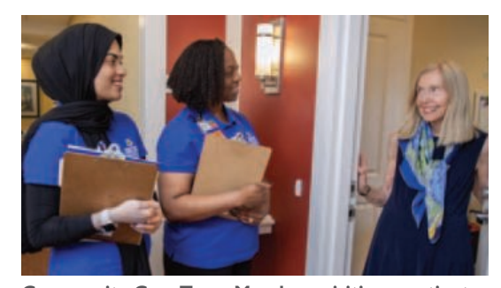
Community Care Team Members visiting a patient.

knowledgeable about resources across Howard County and have developed strong partnerships with many community organizations, including the Howard County Health Department, the Howard County Office on Aging and Independence, and transportation programs like Neighbor Ride. Over the last two years, CCT has had almost 2,800 referrals with over 60% of the referrals accepting assistance from the team to gain help in connecting to the right supports and reducing their chance of being re-hospitalized.