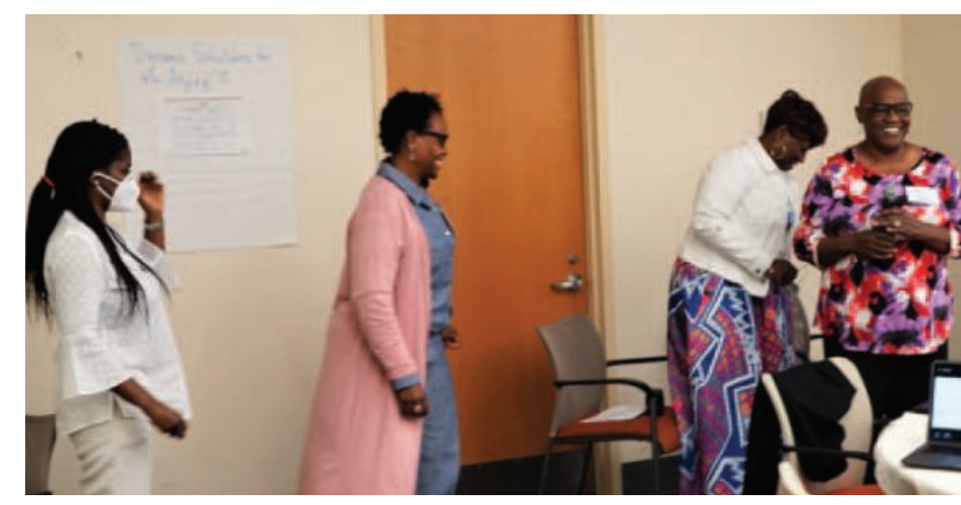
Ward Infinity - Dynamic Solutions for the Aging

Ward Infinity invites people to apply, provides mentors, business support and education, community building, and both a stipend to the team and an opportunity to compete for a prize in a pitch competition. In fiscal year 2022, Sibley selected a cohort of 16 people to work on 5 projects