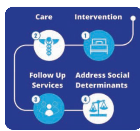
Infographic from HAVI website: https://www.thehavi.org/what-is-an-hvip

the risk of a future violent injury. Critical to the success of the program is the understanding that the trauma from violence affects all aspects of a person's life. The program follows clients beyond hospitalization until such time as they are successfully transitioned to community-based programs for long-term trauma-informed support. Break the Cycle serves patients who come to JHH with gunshot wounds or stab wounds between the ages of 15 and 35. Within the hospital, BC-HVIP works in an integrated manner with care coordination teams to address the client's needs, in particular social determinants of health, and provide connection and referral to community agencies and nonprofits that can address those needs.