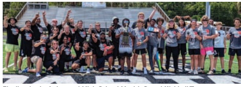
Finalists in the Lakewood High School Health Squad Kickball Tournament

To stir-up school spirit, encourage physical activity, students and staff at Lakewood High School participated in a kickball tournament, culminating in a nail-biting match between the students and teachers. More than 120 boys and girls engaged in an elimination